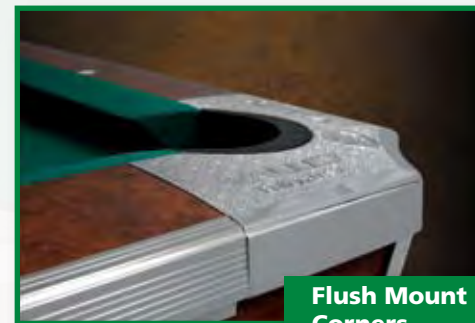
Flush Mount Corners