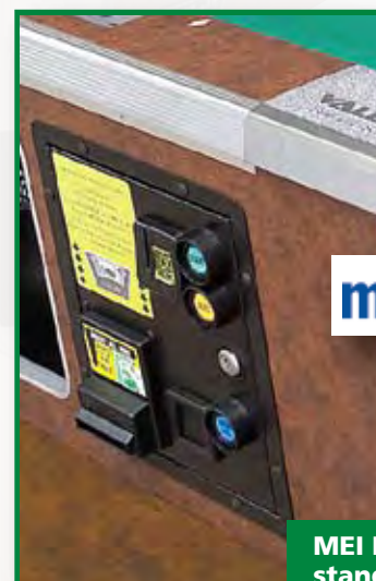
MEI Bill Acceptor standard on every table