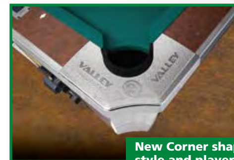
New Corner shape for style and player comfort